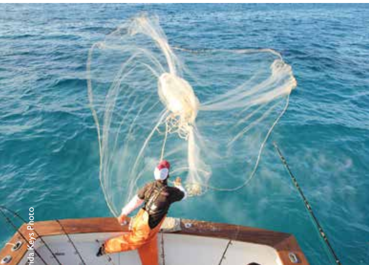
Tide Keys Photo