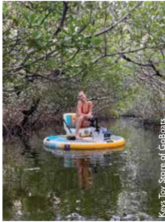
Keys Toy Store of GoBoats

Please mention you found this listing in the Islamorada Chamber Guide