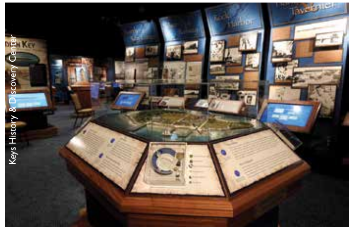
Keys History & Discovery Center

MM 85.5 (O), 305-664-0091, boatrentalsinthekeys.com Closest boat rental to the world-famous Sandbar. Enjoy hourly, daily, and multi-day boat rentals with discounts, plus pet-friendly options.