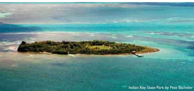
Indian Key State Park