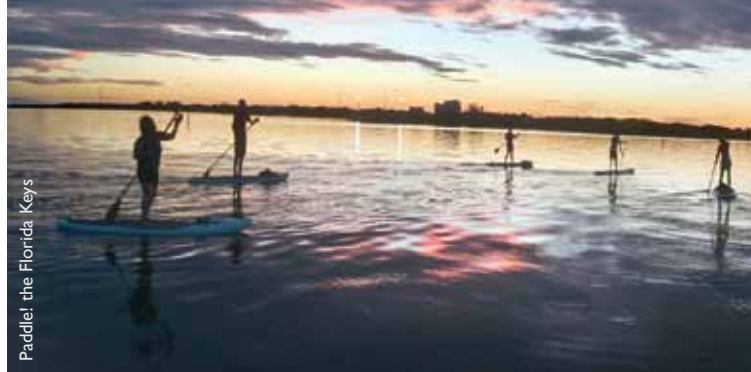
Paddle the Florida Keys

MM 70 (B), 305-249-1036, www.rvonthego.com Spacious 28-acre resort located on an island all its own. On-site marina, RV hookups, cottage rentals, campground. Full amenities including vacation activities, restaurant, beach bar, free WiFi hotspots, spa, and pool.