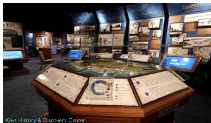
Keys History & Discovery Center

MM 73.8 (O), 305-664-8811, www.caloosacove.com Full service marina, restaurant, lounge and boat rentals.