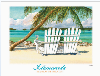
Our first Island Fest collectible poster from 2005 by Klaus Schuler

P.O. Box 915, Islamorada, Florida 33036 Islamorada Chamber of Commerce