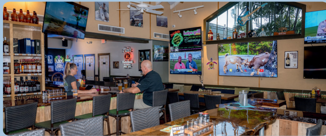
81219 Overseas Hwy Islamorada MM 81.9