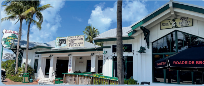
81219 Overseas Hwy Islamorada MM 81.9