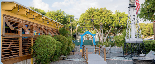
81701 Old Hwy Islamorada MM 81.7