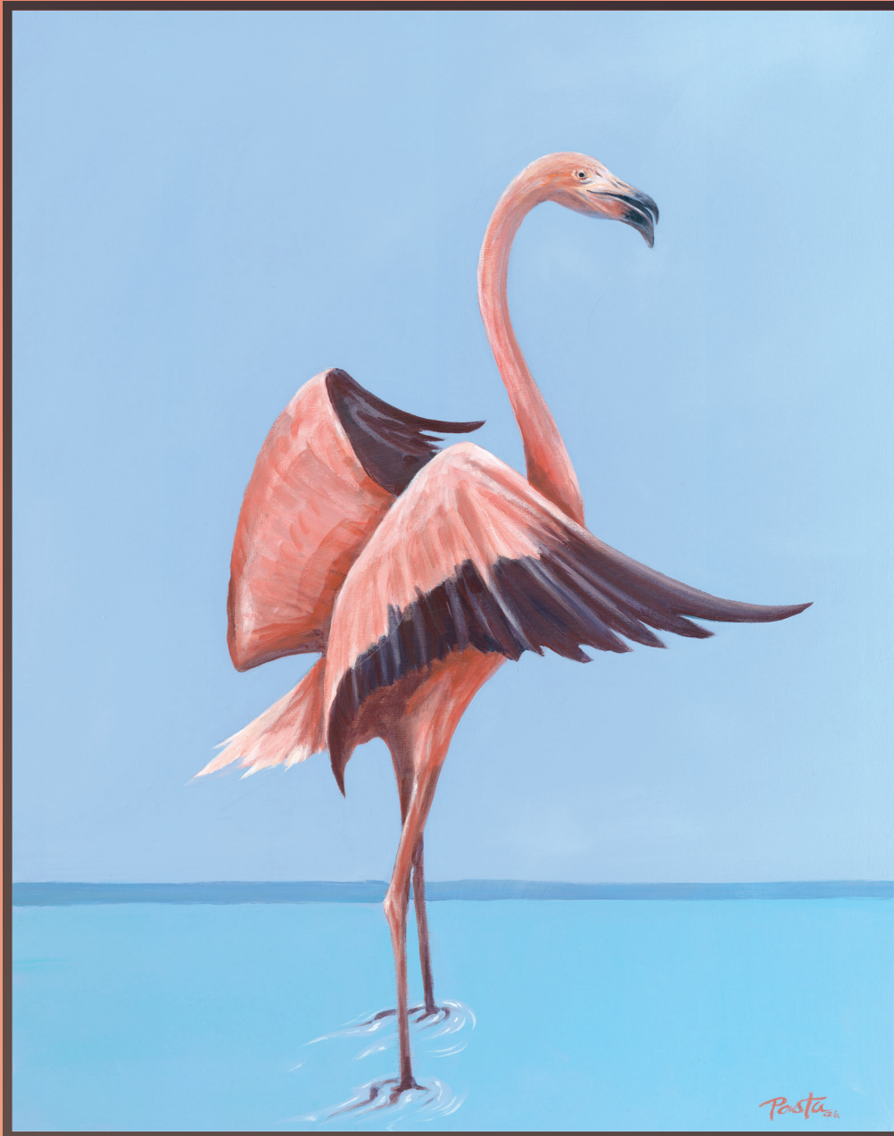
"Sea You Later"