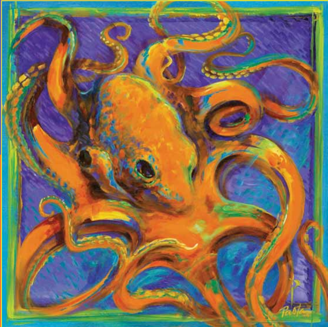
"Orange Whip" by Pasta Pantaleo